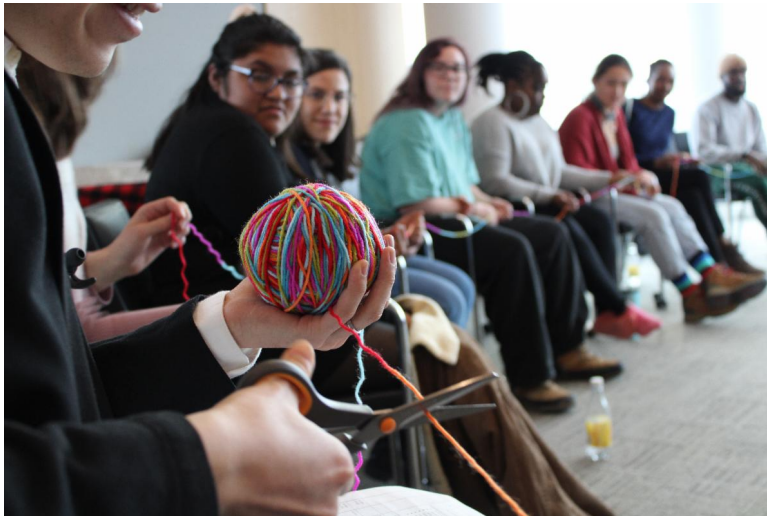
Our EDUC 4826 mid-semester retreat last month

As a team of dedicated educators, we strive to practice what we teach (and learn!) in all areas of our work. We strongly believe that in order to continue developing new, courageous and relevant, educational processes, we must always be at our learning edge. This means we are constantly evaluating our successes and challenges, and experimenting with new approaches to exploring our humanity.