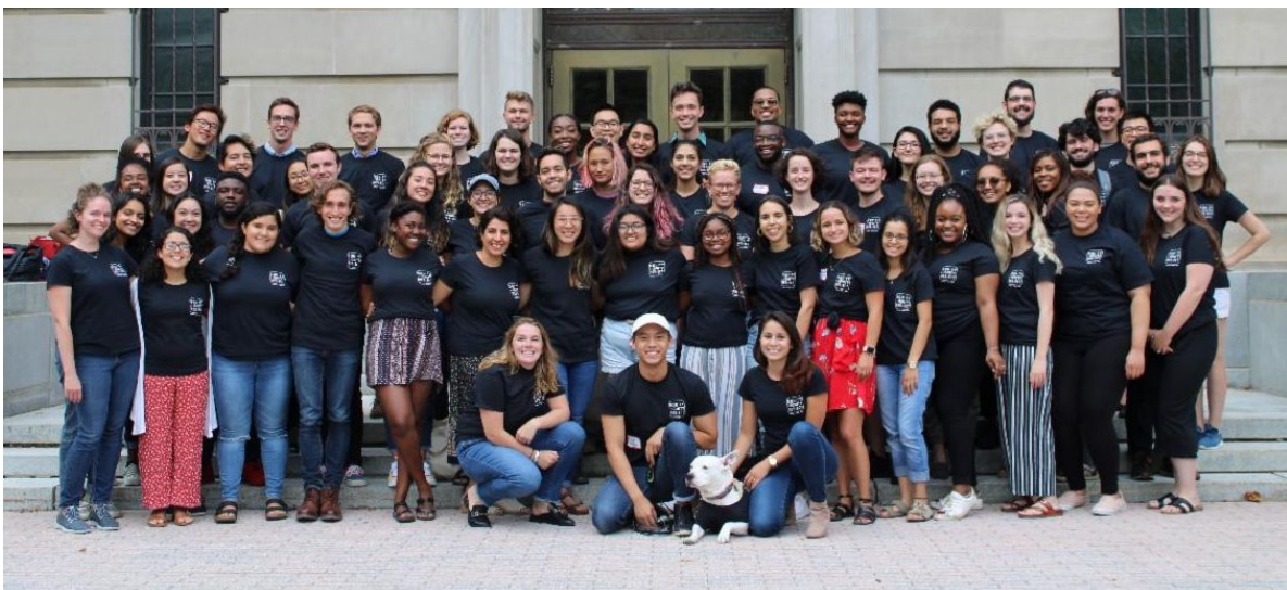
Fall 2019 Orientation Facilitators

Read on for more about ongoing and upcoming developments!