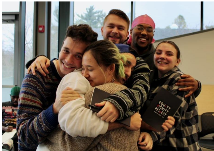
Some of our wonderful EDUC 2610 facilitators